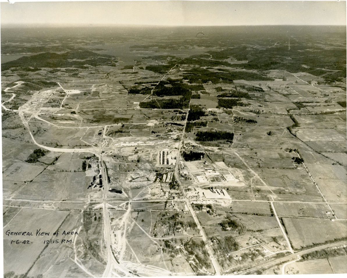
GENERAL VIEW of AREA 1-6-42. 12:15 P.M.