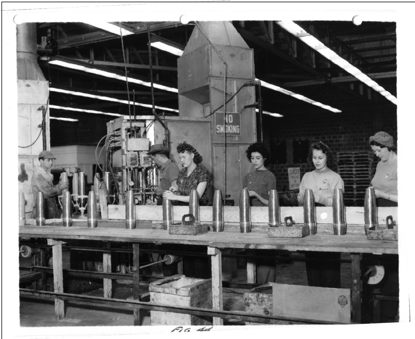
Gadsden Ordnance Plant