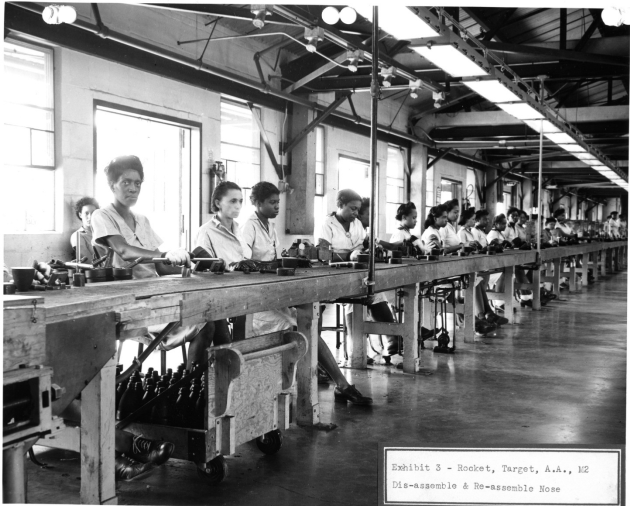
Exhibit 3 - Rocket, Target, A.A., M2 Dis-assemble & Re-assemble Nose